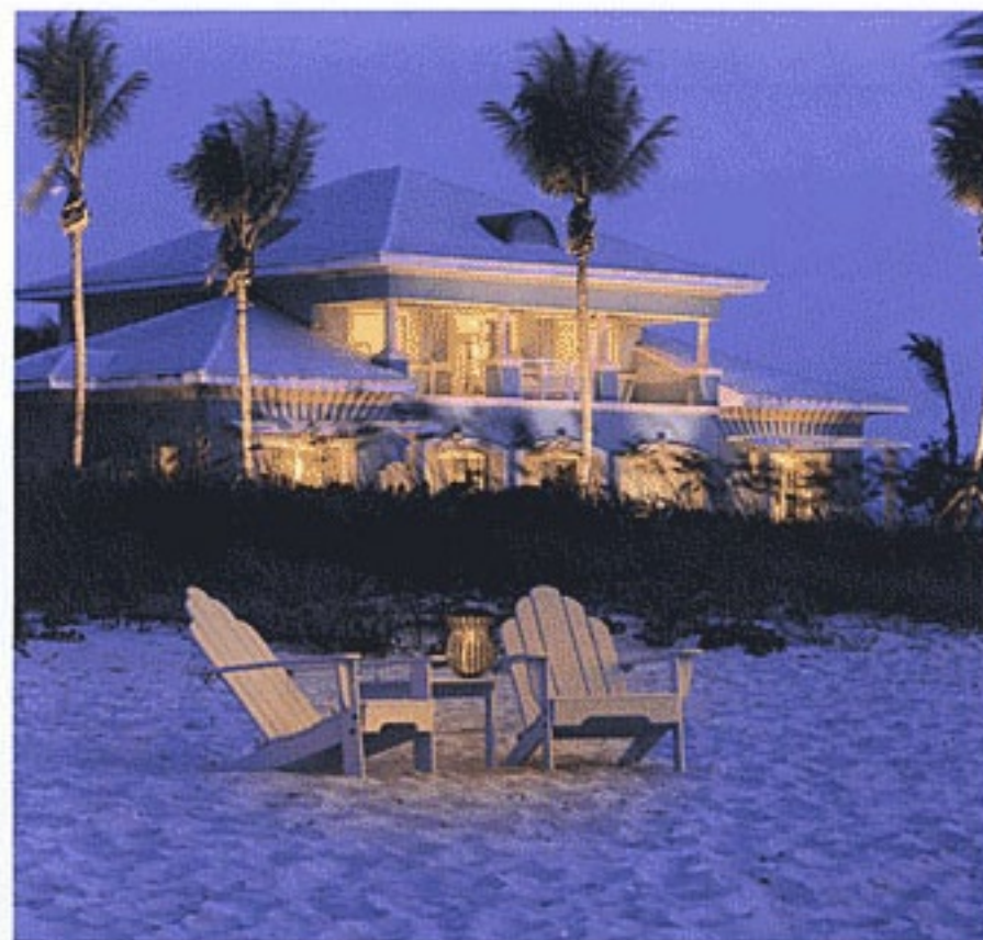
Evening falls at Four Seasons Resort Residences

The upscale community also boasts a European-style spa and a Greg Norman-designed golf course with views so spectacular they make it difficult to